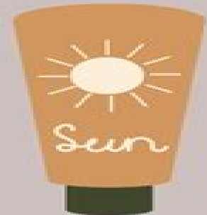
go out for fresh air