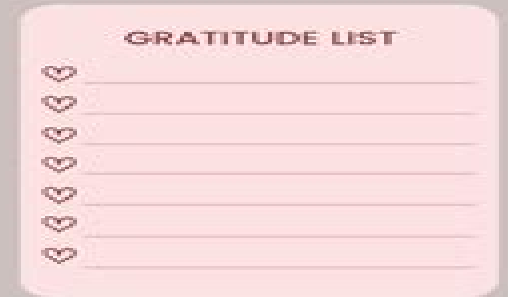
5 minute journal