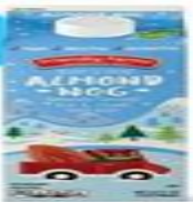
Friendly Farms Almond MFG 12-oz.