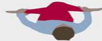
RECLINING COW FACE