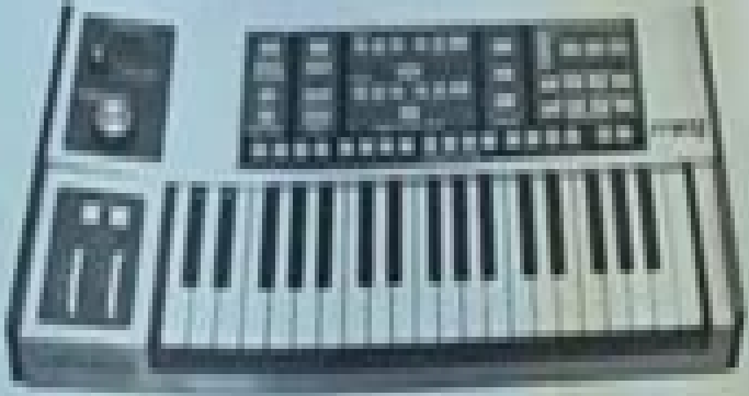
EXPERT MODEL 3074 EXPERT MODEL 3088