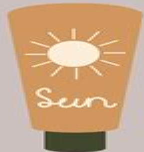
go out for fresh air