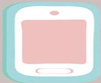
go screen free for 30 minutes