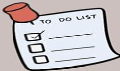
top priority to do list