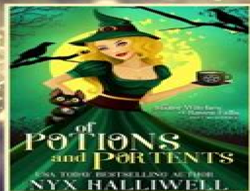
SISTER WITCHES OF RAVEN FALLS