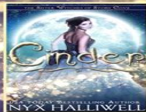
SISTER WITCHES OF STORY COVE