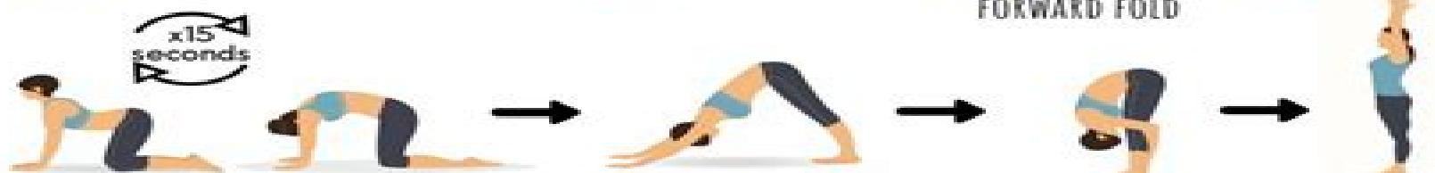
5 STANDING BACKBEND