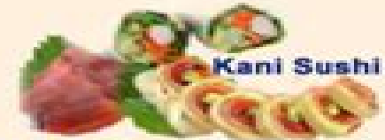
no rice 150/2/15