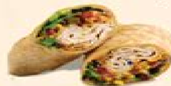
Low carb wrap tuna, chicken, turkey, beef, ham, cheese, mustard. NO MAYO 250/6/16