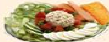
Tuna, chicken, egg salad & Melba toast 1cup: 383/10/30