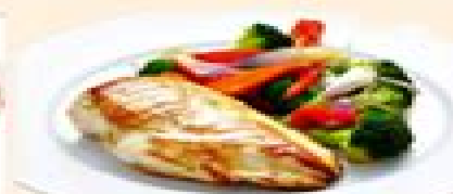
grilled chicken, fish no skin, no carb 6oz: 230/3/40