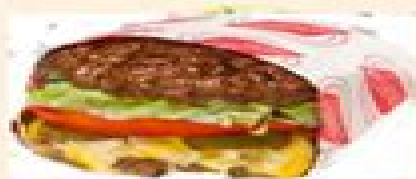
Burger: hold bun 6oz: 400/3/40