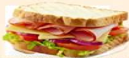
ham, tuna, chicken, turkey. low fat mayo, mustard 450/8/15