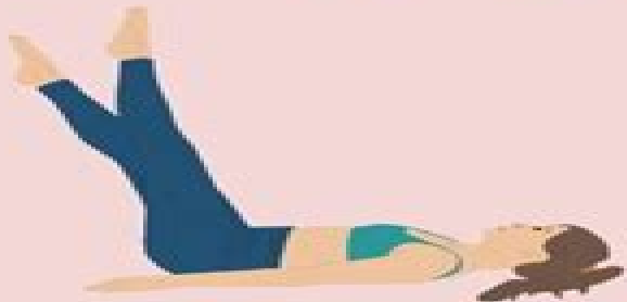
5. THE HUNDRED