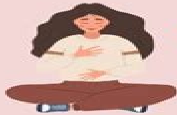
1. WARM-UP: PILATES BREATHING