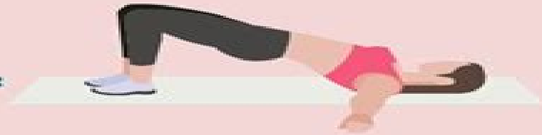
2. PILATES BRIDGE