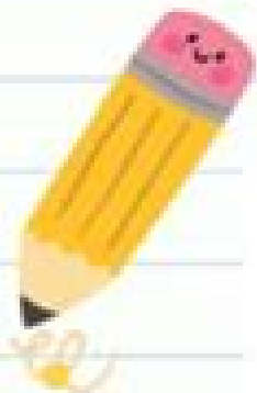
Weekly Word List

Phonetic words: words that are spelled the way they sound. They are easy to learn and remember.